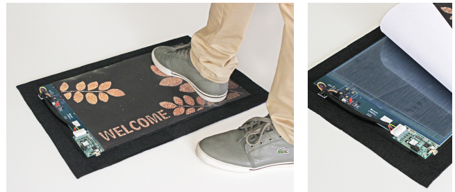
Figure 1: Functional CapMat Prototype. Right photo shows the underlying Synaptics capacitive sensor matrix.

We utilized a machine learning approach to understand the data, such as the specific properties of shoes (e.g. size, profile and wear), as well as user individual factors (e.g. weight and weight distribution). Future work will investigate an automatic feature extraction using deep learning to increase the stability of our system. We envision multi-factor authentication for smart environments to be a suitable application.